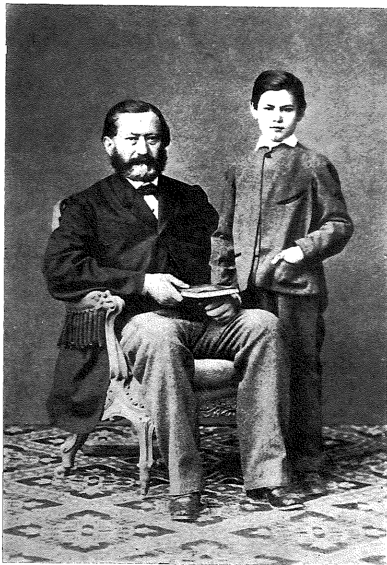
Sigmund Freud with his Father in 1864