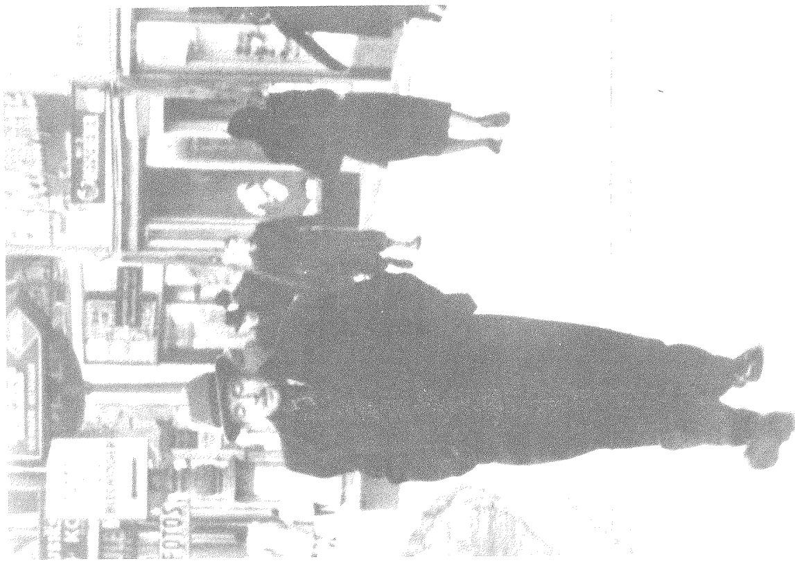
The Wolf-Man on a street in Vienna, during the Nazi occupation