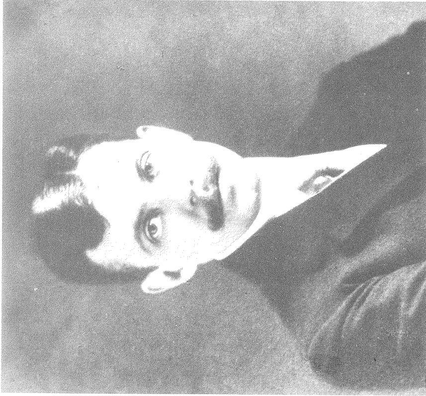
Above: The Wolf-Man, about 1910

His childhood now falls clearly into the following epochs: first, the earliest period up to the seduction when he was three and a quarter years old, during which the primal scene took place; secondly, the period of the alteration in his character up to the anxiety dream (four years old); thirdly, the period of the animal phobia up to his initiation into religion (four and a half years old); and from then onwards the period of the obsessional neurosis up to a time later than his tenth year. That there should be an instantaneous and clear-cut displacement of one phase by the next was not in the nature of things or of our