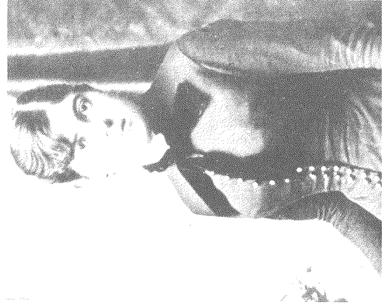
Left: The Wolf-Man's mother as a young woman