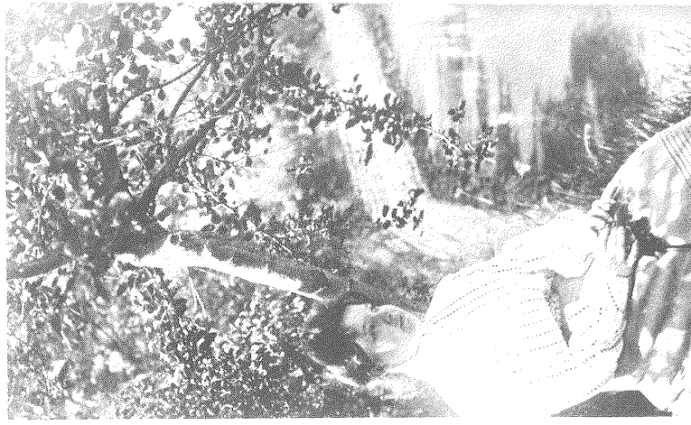
Above left: The Wolf-Man's father, 1907